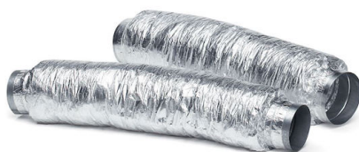
Flexible silencing canalization 9700 602