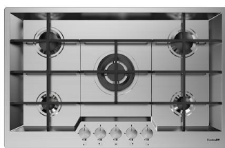
Cooker hob KE 7602 032