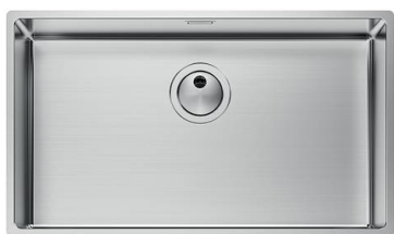
Sink S4001 3138 850