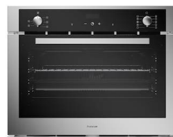
Oven KE 75 7137 000