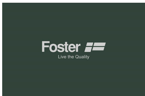
Carbon filters kit 9700 221